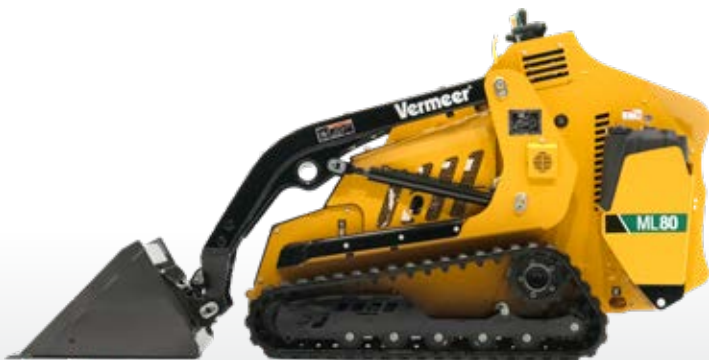
ML80 (25 HP CLASS)

Your crew needs dependable, versatile equipment that can tackle every phase of a project. Vermeer mini loaders deliver. Engineered with increased lift capacity and an enhanced hydraulic system, these mini loaders build on proven features from previous models. The result? A mini loader lineup that's equipped to help you do more.