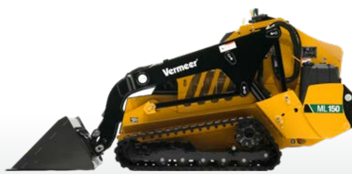
ML150 (40 HP CLASS)