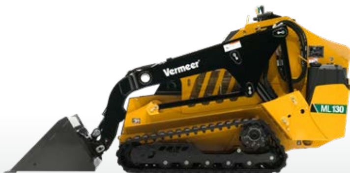
ML130 (40 HP CLASS)