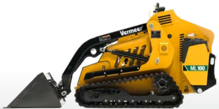
ML100 (25 HP CLASS)