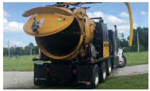
CAM-OVER REAR DOOR. The highly reliable cam-over design provides a 360-degree positive seal, with no additional clamping and no in tank moving parts.