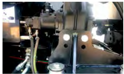
OMSI GEARBOX. OMSI air-shift transfer case is a proven design used throughout the industry to provide the power of the engine to all vacuum components for maximum efficiency and power.