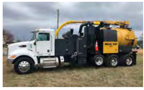
LIGHTWEIGHT. One of the lightest 8-cu yd3 (6.1-cu m³) trucks in the industry to maximize payload. Optional air weigh scale available to monitor live weight of the truck and payload.