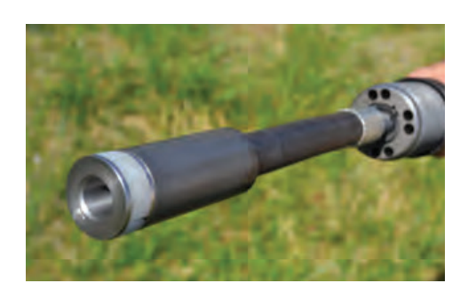
MAXIMUM RELIABILITY. Proven positiveturn reverse design has minimal moving parts, delivering maximum reliability.