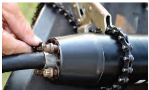
EFFICIENT TOOL MAINTENANCE. Tailbolt system provides ease of access for tool maintenance, requiring a maximum of only 35 ft-lb (47.5 Nm) of torque.