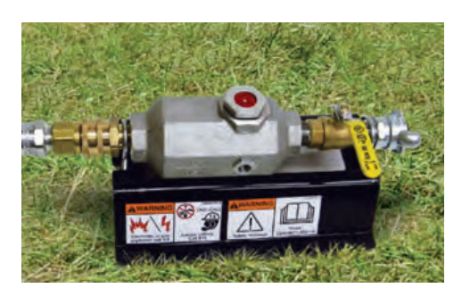
OPERATOR-FRIENDLY FEATURES. Oiler assemblies feature a quick reverse swivel kit for air-on reversing, a sight glass to see oil levels and a pressure relief cap.