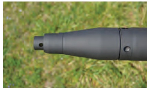
EXTENDED TOOL BODY LIFE. Replaceable head design is a heat-treated alloy to protect the tool body and can be replaced to help extend the tool body life.