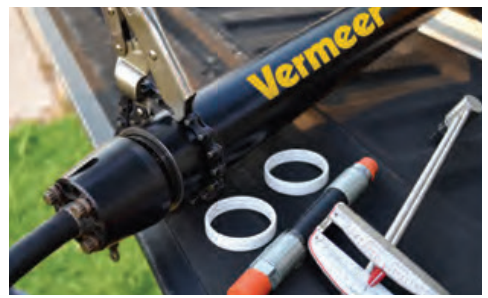
LONG-LASTING PERFORMANCE. Wear rings on pistons help extend tool life and maximize tool performance.