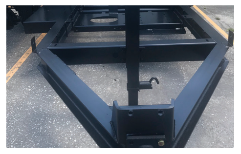
I BEAM TRAILER. Units are built from start to finish at our factory, including the trailer which consists of a sturdy I beam construction.