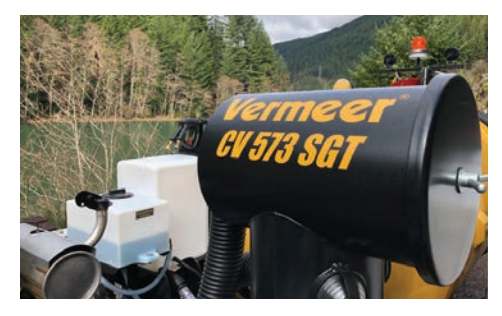
.5 MICRON FILTRATION. Cyclonic filtration separator as well as a secondary filter to clean the air down to .5 microns.