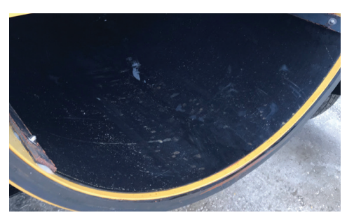
POLYMER LINER. The polymer liner inside the debris tank on the bottom half makes for ease of dumping and cleanout.