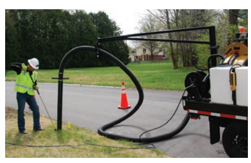
STRONG ARM (OPTION). With 270-degree rotation, the strong arm supports the weight of the vacuum hose, and the roller head makes handling efficient by allowing smooth, fluid movements and adjustments.