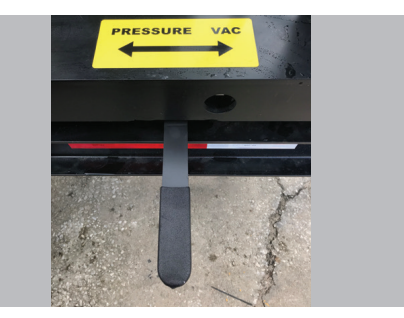
REVERSE PRESSURE. Reverse pressure to offload liquids and dislodge debris in hose.