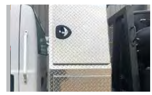
TOOL BOX. Two-shelf storage box located on the driver's side to store jobsite tools.