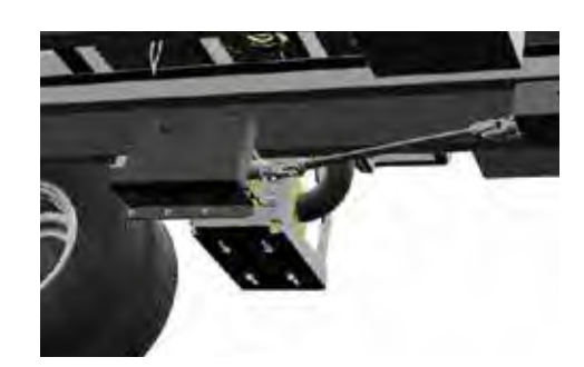
PTO DRIVEN. All components are controlled from the truck eliminating the extra weight, space and cost of the pony motor.