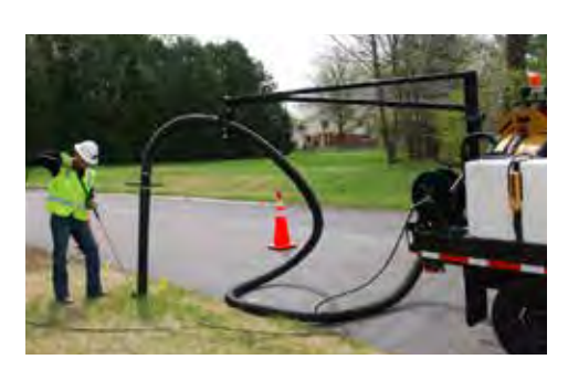
STRONG ARM (OPTION). With 270-degree rotation, the strong arm supports the weight of the vacuum hose, and the roller head makes handling efficient by allowing smooth, fluid movements and adjustments.