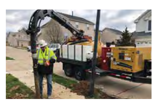
SIDE HOSE AND TOOLING (SHT) STORAGE (OPTION). The new SHT package allows for 60 ft (18 m) of suction hose storage on a trailer-mounted unit. This doubles the traditional 30-ft (9-m) hose storage on all other brands.