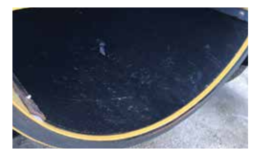
POLYMER LINER. The polymer liner inside the debris tank on the bottom half makes for ease of dumping and cleanout.