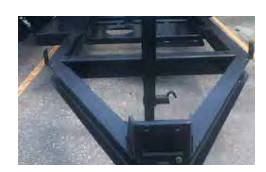
I BEAM TRAILER. Units are built from start to finish at our factory, including the trailer which consists of a sturdy I beam construction.