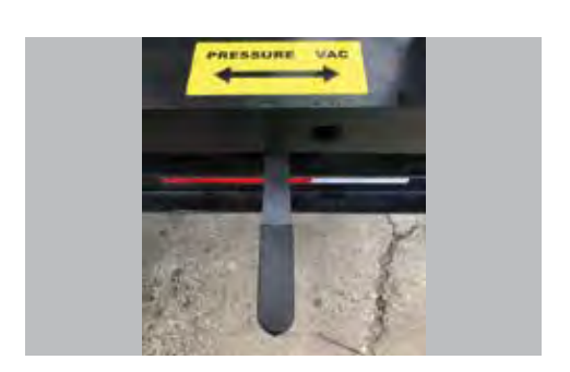
REVERSE PRESSURE. Reverse pressure to offload liquids and dislodge debris in hose.