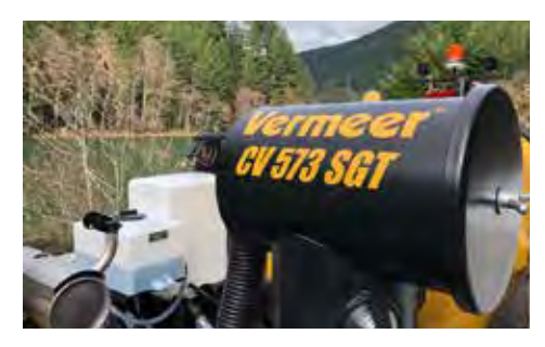
.5 MICRON FILTRATION. Cyclonic filtration separator as well as a secondary filter to clean the air down to .5 microns.