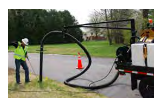
STRONG ARM (OPTION). With 270-degree rotation, the strong arm supports the weight of the vacuum hose, and the roller head makes handling efficient by allowing smooth, fluid movements and adjustments.