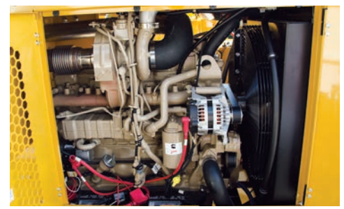
POWERFUL PERFORMANCE. A 275 hp (205 kW) engine allows you to not only meet emission requirements but also enough horsepower to meet your jobsite needs.