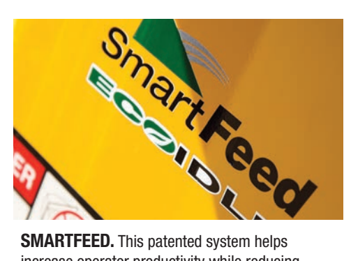
SMARTFEED. This patented system helps increase operator productivity while reducing strain on vital engine parts. The feedsensing control system monitors engine rpm and automatically stops and reverses the feed roller when feeding larger, hardwood material.