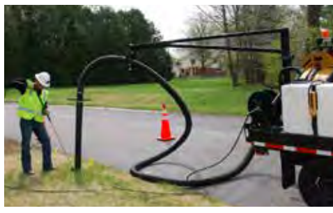
STRONG ARM (OPTION). With 270-degree rotation, the strong arm supports the weight of the vacuum hose, and the roller head makes handling efficient by allowing smooth, fluid movements and adjustments.