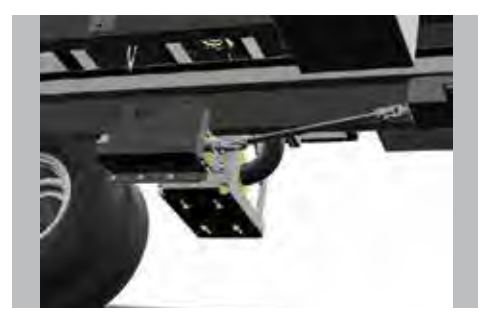
PTO DRIVEN. All components are controlled from the truck eliminating the extra weight, space and cost of the pony motor. Available on a Ford F-650 or F-750 chassis.