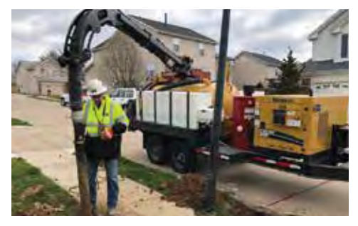
HYDRAULIC BOOM (OPTION). The hydraulic boom offers a 6-way function, wireless remote with vacuum valve operation, 330-degree rotation, remote water jet for ease of cleanout, and a 5-in (13-cm) hose with quick connect to 4-in (10-cm) tooling.