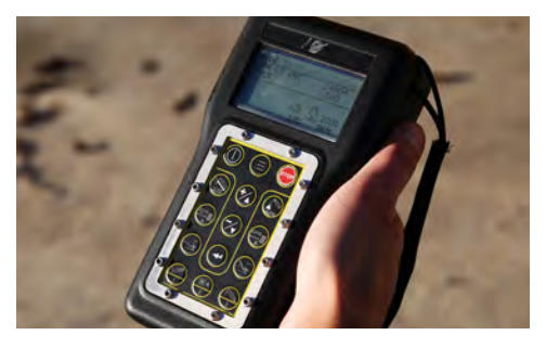
ADVANCED CONTROLS. Operators can control the machine through either the Vermeer DP10 display mounted on the control panel, or through a handheld transceiver remote.