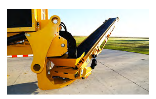
RADIAL STACKING CONVEYOR. Simple stacking conveyor with 180-degree arc increases the amount of material being stacked on the ground. Adjustable stacking height aids with dust control and helps avoid material being blown away.