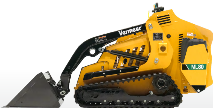
ML80 (25 HP CLASS)

Your crew needs dependable, versatile equipment that can tackle every phase of a project. Vermeer mini loaders deliver. Engineered with increased lift capacity and an enhanced hydraulic system, these mini loaders build on proven features from previous models. The result? A mini loader lineup that's equipped to help you do more.