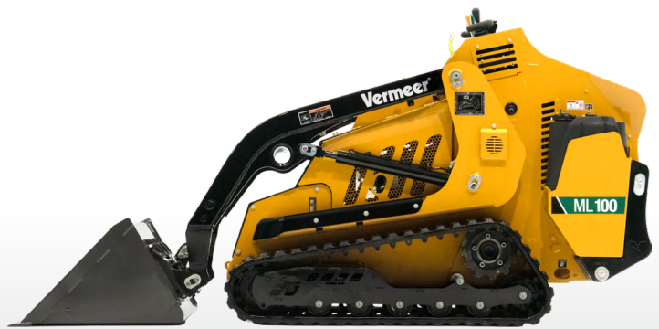
ML100 (25 HP CLASS)