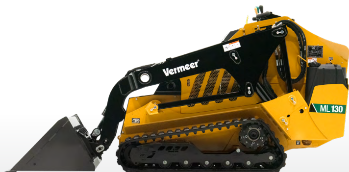
ML130 (40 HP CLASS)