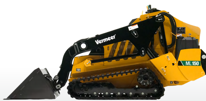
ML150 (40 HP CLASS)