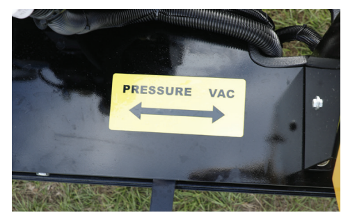
REVERSE PRESSURE (OPTIONAL). Reverse pressure to offload liquids and dislodge debris in hose.