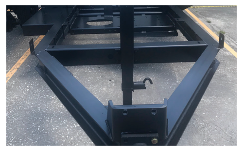
I BEAM TRAILER. Units are built from start to finish at our factory, including the trailer which consists of a sturdy I beam construction.