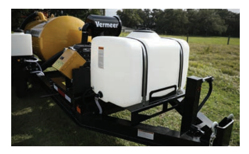
WATER TANK (OPTIONAL). 100 gal water tank with 3.5 gpm (13.2 l/min) @ 2,500 psi.