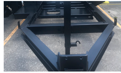
I BEAM TRAILER. Units are built from start to finish at our factory, including the trailer which consists of a sturdy I beam construction.