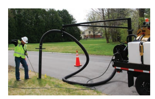
STRONG ARM (OPTION). With 270-degree rotation, the strong arm supports the weight of the vacuum hose, and the roller head makes handling efficient by allowing smooth, fluid movements and adjustments.