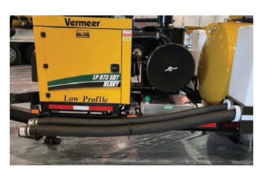
SIDE HOSE AND TOOLING (SHT) STORAGE (OPTION). The new SHT package allows for 60 ft (18 m) of suction hose storage on a trailer-mounted unit. This doubles the traditional 30-ft (9-m) hose storage on all other brands.