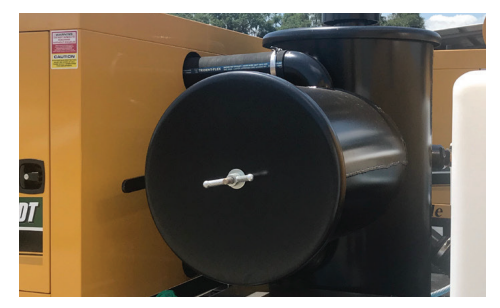
CVS (CYCLONE 4-WAY VALVE SILENCER) FILTRATION SYSTEM. .5-micron filtration. The CVS filter housing also contains the 4-way valve for reverse pressure and an oversized silencer for quiet operation. The silencer is located inside the 28-in (71-cm) diameter cyclone.