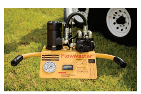
FLOWMASTER (OPTION). The FlowMaster option can be used to hydraulically exercise water valves and hydrants, making sure they will work properly in times of need.