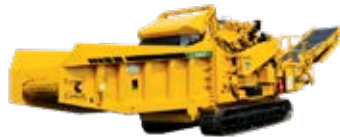
/ HG6000TX / GROSS HORSEPOWER (MAXIMUM): 772 hp (568 kW)